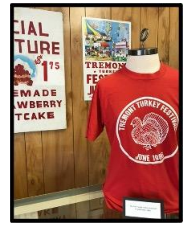
Part of the Turkey Festival display at the museum

Tremont Betterment Association (TBA) is the organizing committee for our festival. It is a committee made up of past Turkey Festival chairman and is responsible for setting festival budgets and policies. You may wonder...how do the proceeds get distributed? Once a year the committee receives grant requests from the community to distribute the prior year's festival proceeds. You can always find the list of entities that receive money from the last festival on turkeyfestival.com under the "about" tab. The list of projects and improvements to Tremont that have been made possible by our annual festival is very long and contributes to making our small town a desirable place to call home. Without the money raised by the festivals over the years, the projects referenced above and many, many more, would not be possible.